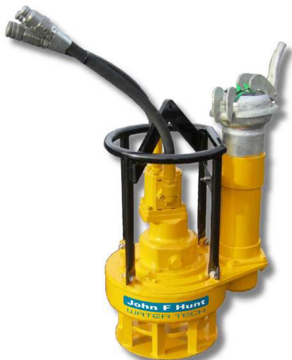
4 inch Submersible