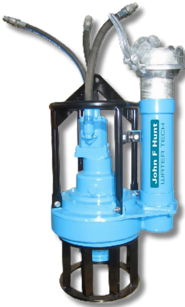
4 Inch Screw Submersible